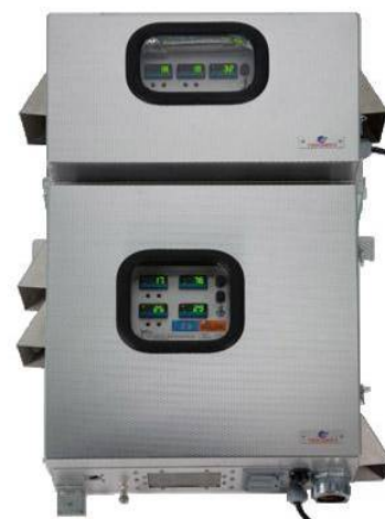
Shown installed with Model 1130

One of the greatest problems with conventional particulate mercury measurement methods is that reactive gaseous mercury will be trapped on the filter medium along with the particulate bound mercury. This can result in large measurement artefacts. The Tekran speciation system solves this problem by removing the reactive gaseous component using a denuder before sampling the particulate mercury.