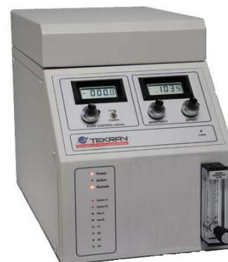
Model 2600 AF Mercury Analyzer