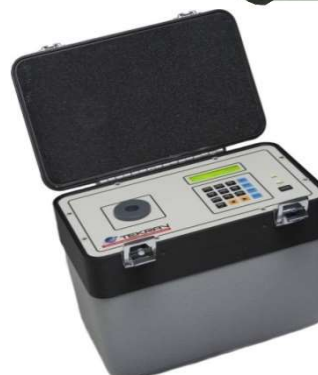
Model 2505 Calibration Unit