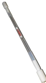
Tekran Gold-Quartz Sampling Trap